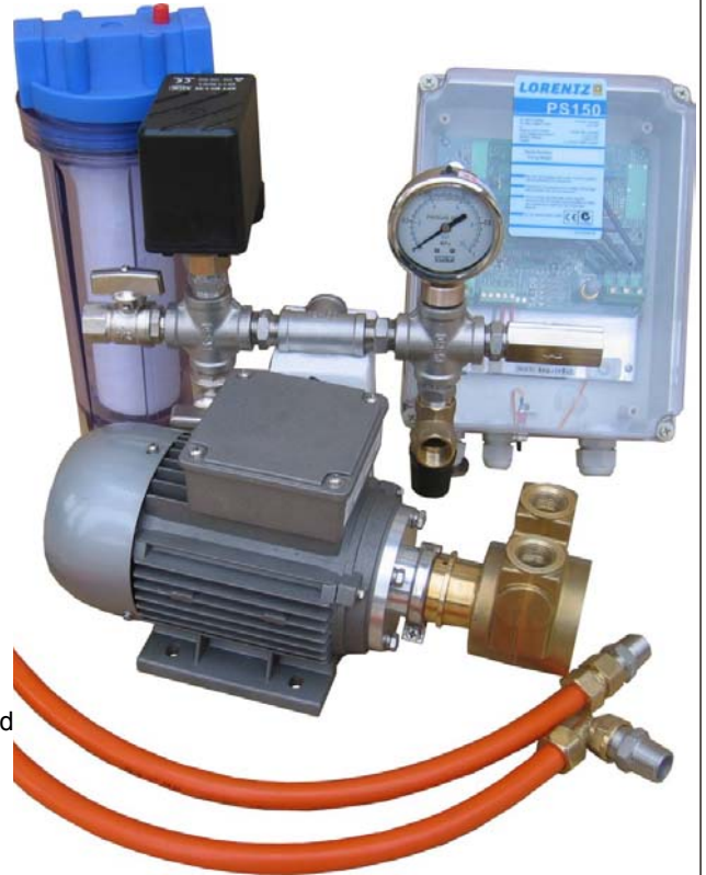
PS150-Boost with Installation Kit #2065 and Inline Filter #2075